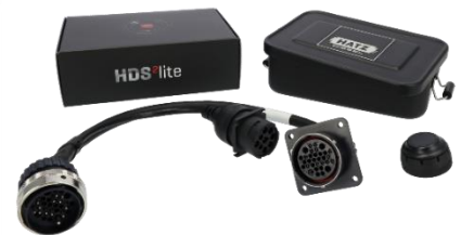
H50 HDS 2 lite Kit 65794200