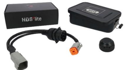
E1 HDS 2 lite Kit 65794300