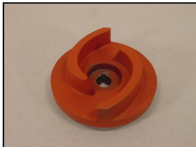
OLD STYLE IMPELLER